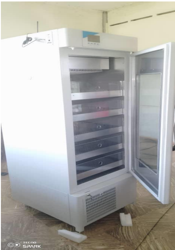
The arrival of the new blood refrigerator.